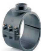
6 tornillos de \varnothing 140 a \varnothing 200 mm.